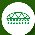
CROP PROTECTION EQUIPMENT