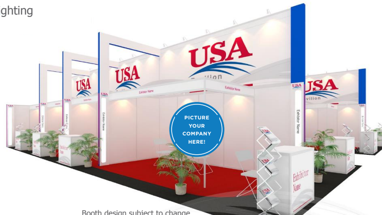
Booth design subject to change