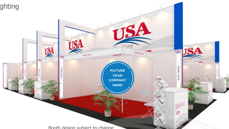
Booth design subject to change