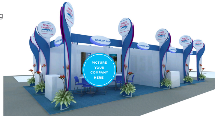
Booth design subject to change