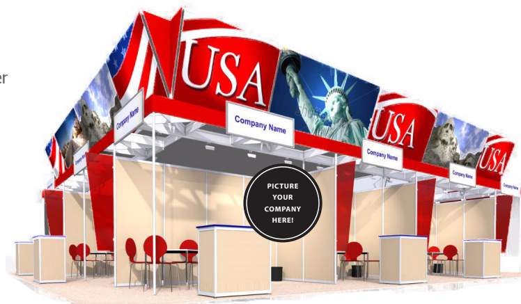
Booth design subject to change